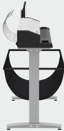
Required depth less than 25", 65cm