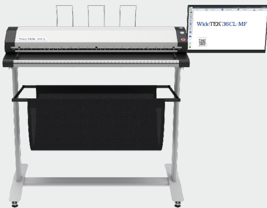
Very compact design