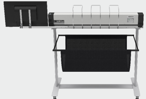
PC built in, no extra hardware in the back