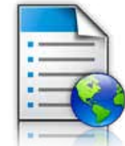
Forms and Favorites